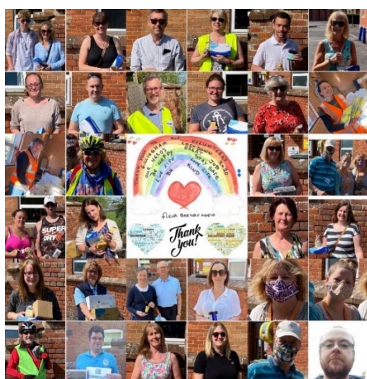
Some of the Gillingham Volunteers

This great achievement was acknowledged by the High Sheriff of Dorset, who following a visit to the town, awarded Gillingham the High Sheriffs Community Award. A great honour for our fabulous town and its wonderful community.