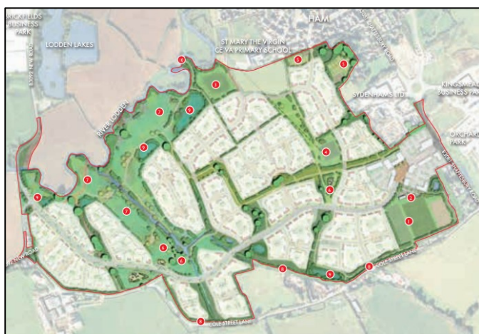
Proposed Southern Extension

I would like to thank everyone who has been involvement in these areas but especially the Town Clerk, the Deputy Town Clerk and their teams.