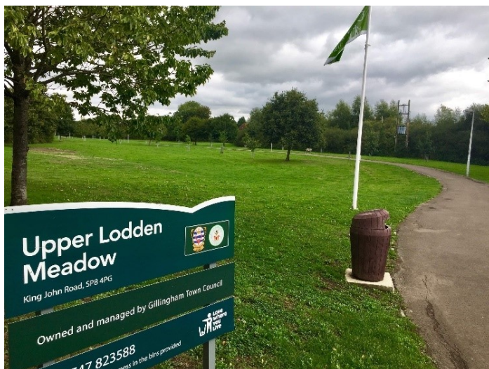
Green Flag site, Upper Lodden Meadow

Once again, Green Flags were awarded to Gillingham Town Council's public open spaces. We are extremely proud to be awarded the Green Flag, in recognition of continually working to ensure that our community has access to professionally managed and developed open spaces. These areas, which all have extensive management plans, are regularly reviewed by the grounds team and the Estates Management sub-committee. The town council has a commitment to ensure a good balance is maintained for use of the areas by the public and local wildlife. We pride ourselves on the good working relationship we have built over the years with Gillingham Action for Nature (GANG) and Dorset Wildlife Trust.