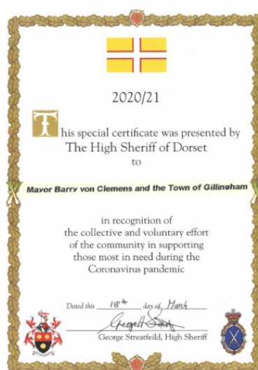
High Sheriff Award