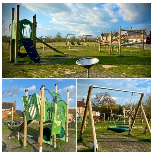
New play equipment, Marlott Road

As part of the council's ongoing programme of maintaining and developing the areas of play that we provide to our community, 2020 saw the refurbishment of the Marlott Road Play Area. This project consisted of the installation of new drainage to help reduce the standing water that this site has suffered in the past. New play equipment has been installed and new fencing will be installed shortly.