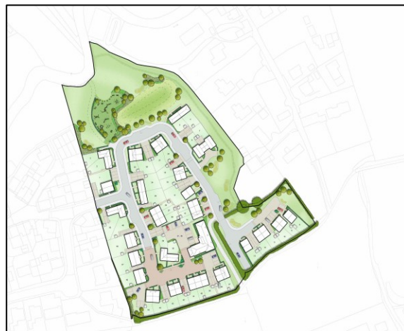
Development at Barnaby Mead