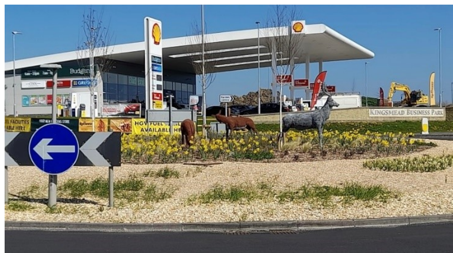
Ham Roundabout, Gillingham

The town council is committed, wherever we can, to promote and encourage the use of alternative transport, such as cycling, public transport and walking. To facilitate this, a covered bus shelter was been installed at the Kingmead/Aldi bus stop.