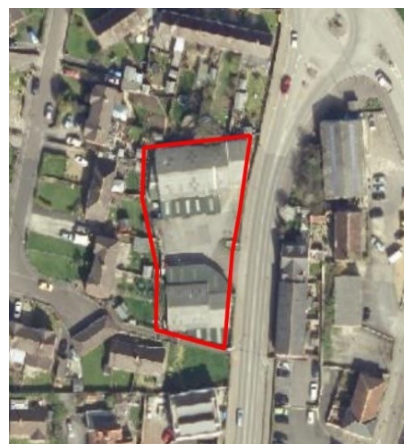
Town Council Workshops, Roman Court, Gillingham

The town council is very proud to have played its part in achieving Gillingham's Dementia Friendly status for another year. This is a great accolade for our town with business and community groups working with Dementia Friendly Gillingham.