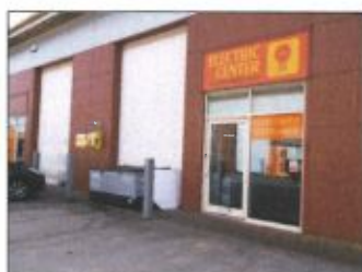
AED located at the Electric Centre Kingsmead Business Park.

This is the second grant Gillingham Town Council has been awarded from SEPD, who set up the fund to support communities, to improve local resilience for future emergencies. The 2016 SEPD grant, resulted in the provision of a significant amount of equipment to be used in support of a natural disaster and other events within the town boundary.