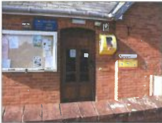
AED located at the side entrance to Gillingham Town Hall, next to the car park.

Gillingham Town Council and the South Western Ambulance Service Trust will host a Defibrillator Awareness Session on Tuesday 24 th April at 7.00pm in Gillingham Bowling Club, School Lane, Gillingham. The Session will last an hour and will cover how to use a defibrillator, how to do CPR and what the difference is between a heart attack and a cardiac arrest. If you would like to attend please contact the Town Hall, via telephone 01747 823588 or email GTC@gillinghamdorset-tc.gov.uk .